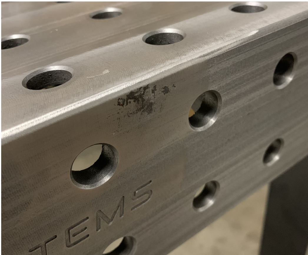
Fig. A: Casting Void Repair

While it will not affect the performance of your ArcFlat Weld Table, please be aware that your weld block(s) may contain some of these cosmetic defects. It is also possible that slight surface rusting can occur on your block after packaging and this can be cleaned quickly with Scotch Bright.